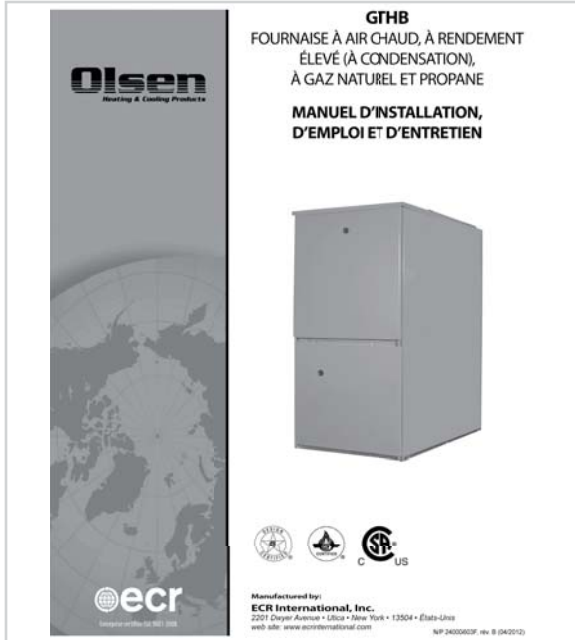
Installation, Operation & Maintenance Manual 240005603F REV B [04/2012]