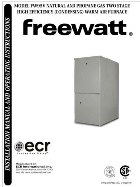
Installation, Operation & Maintenance Manual 240007583 REV D [04/2012]

NATURAL AND PROPANE GAS TWO STAGE HIGH EFFICIENCY (CONDENSING) WARM AIR FURNACE