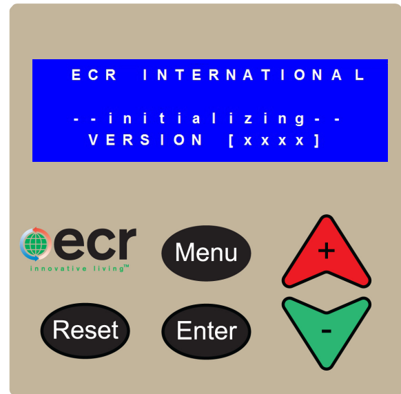
Figure - 2 User Interface 2 Pin Connector