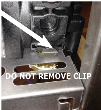
RIGHT SIDE CLIP - INSIDE BOILER JACKET