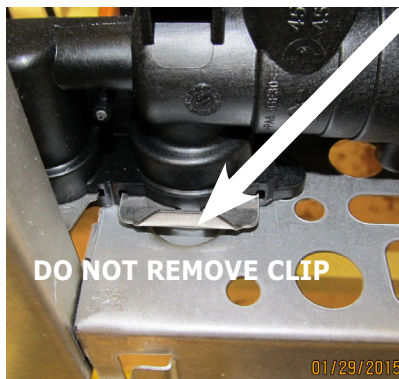
LEFT SIDE CLIP - INSIDE BOILER JACKET