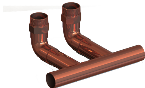
Figure 2 - Manifold 240011820 (half unions not shown)

Illustrations are a depiction of the boiler for general location of parts and are subject to change without notice.