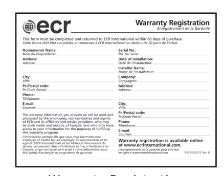
Warranty Registration 1595023 REV B