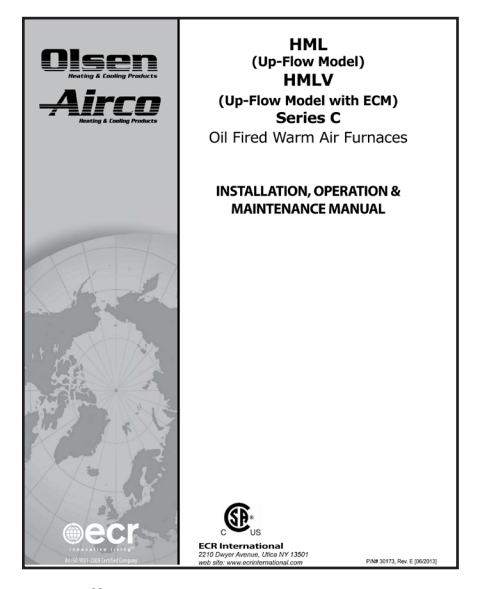
Installation, Operation & Maintenance Manual 30173 REV E [06/2013]

HML-C (Up-Flow Model) HMLV-C (Up-Flow Model with ECM)