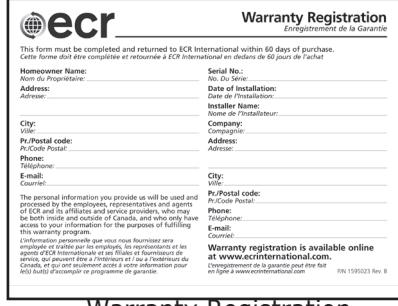
Warranty Registration 1595023 REV B