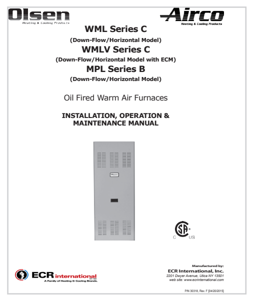
Installation, Operation & Maintenance Manual 30318 REV F [04/2015]

WML-C AND MPL-B (Down-Flow or Horizontal Model) WMLV-C (Down-Flow or Horizontal Model with ECM)