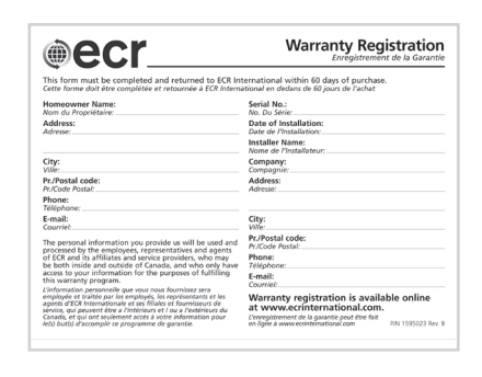
Warranty Registration 1595023 REV B

User's Information Manual Limited Warranty 240005038 REV C 240006450 REV B [10/2012] [09/2014]