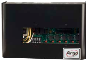
Zone Valve Controls