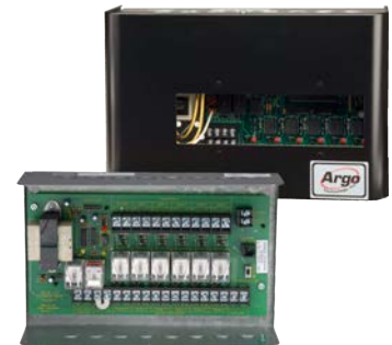
Zone Pump Controls