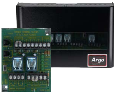
Hydro Air Zone Controls