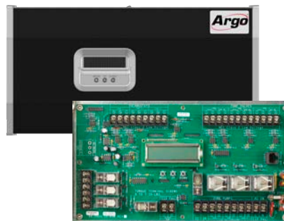
Universal Zone Control