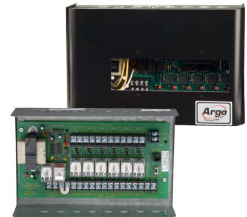
Zone Pump Controls