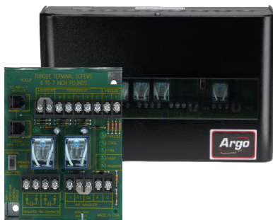
Hydro Air Zone Controls