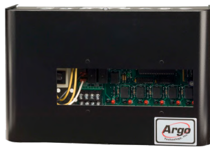
Zone Valve Controls