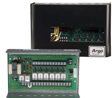
Zone Pump Controls