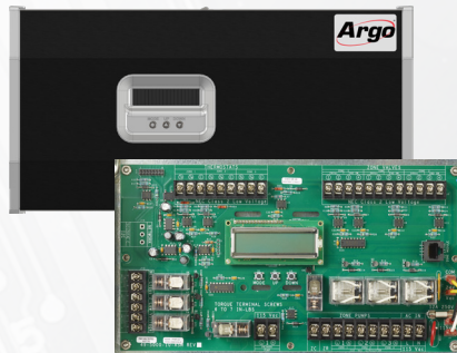
Universal Zone Control