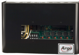
Zone Valve Controls