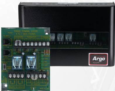
Hydro Air Zone Controls