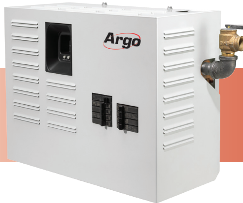
AT Series C Boiler