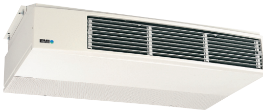
CCP Ceiling Suspended Air Handler