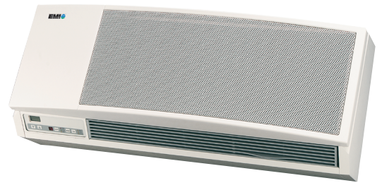
WCP High Wall Air Handler