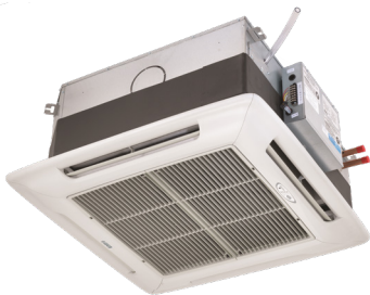
CAW Ceiling Air Handler