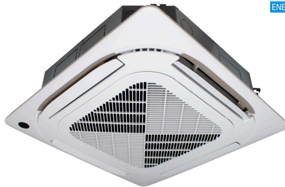
Ceiling Cassette Air Handler