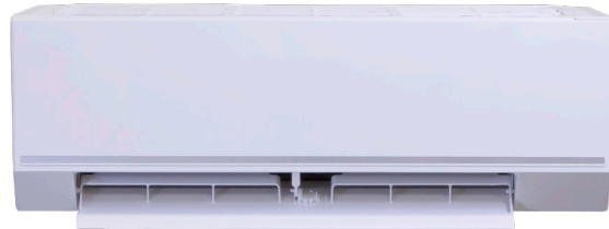
Wall Air Handler