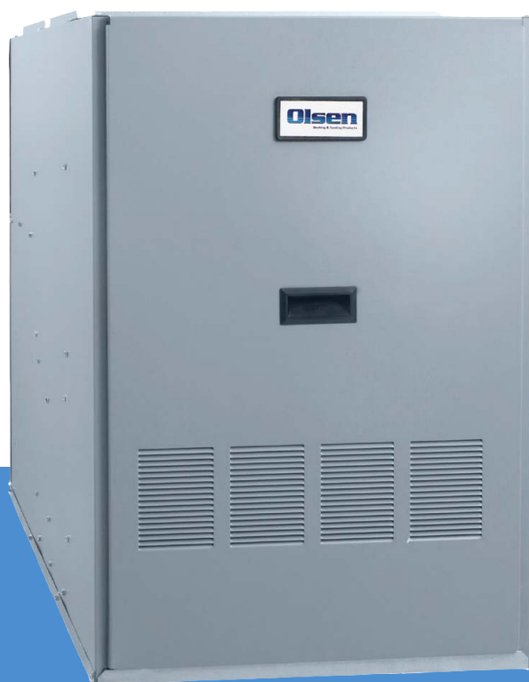
Olsen Oil Fired Furnaces