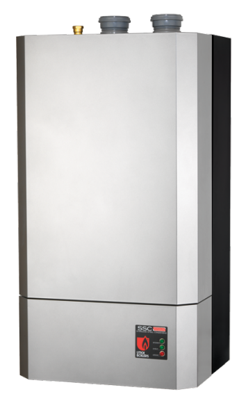
Utica SSC Gas-Fired Modulating Condensing Boiler

with the purchase of any Utica SSC Boiler from December 15th 2014 through February 28th 2015