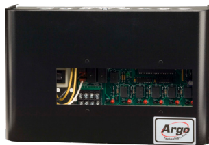
Zone Valve Controls