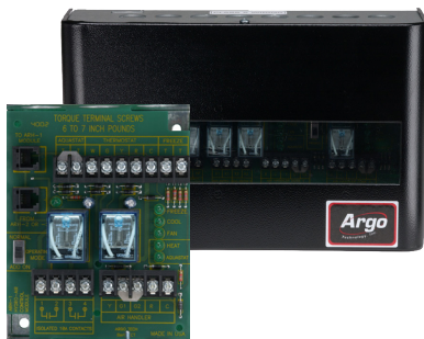
Hydro Air Zone Controls