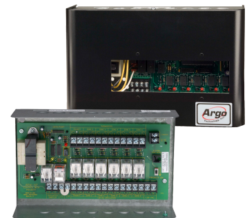
Zone Pump Controls