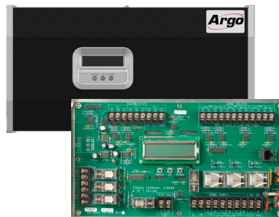
Universal Zone Control