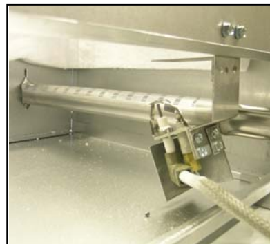
New Style Pilot

If you have any questions regarding the information contained in this letter, please contact our Technical Support Hotline at 1-800-325-5479.